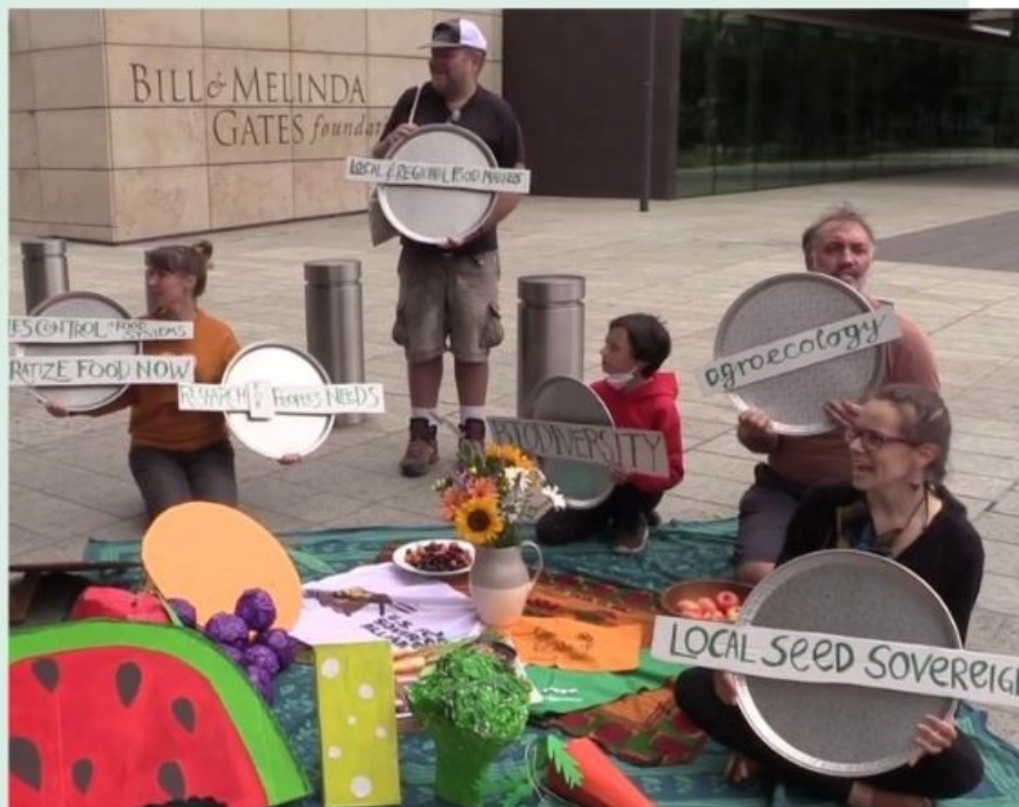
Above photos from the July 2022 theater action at the Gates Foundation to protest the foundation's support of industrialized agriculture.