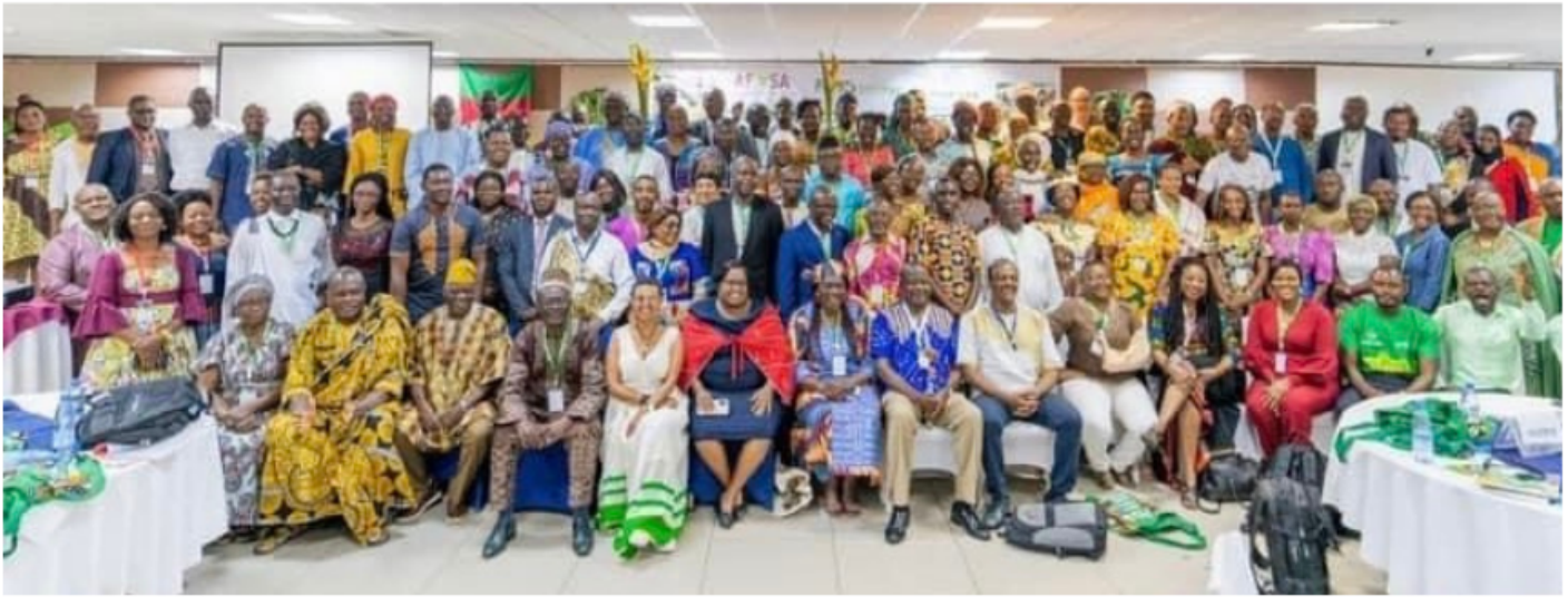
Above: Africa Food Systems Conference in Cameroon

Our AGRA Watch campaign has had a remarkable year, full of exciting wins with our partners and opportunities to reach new audiences and grow our movement.