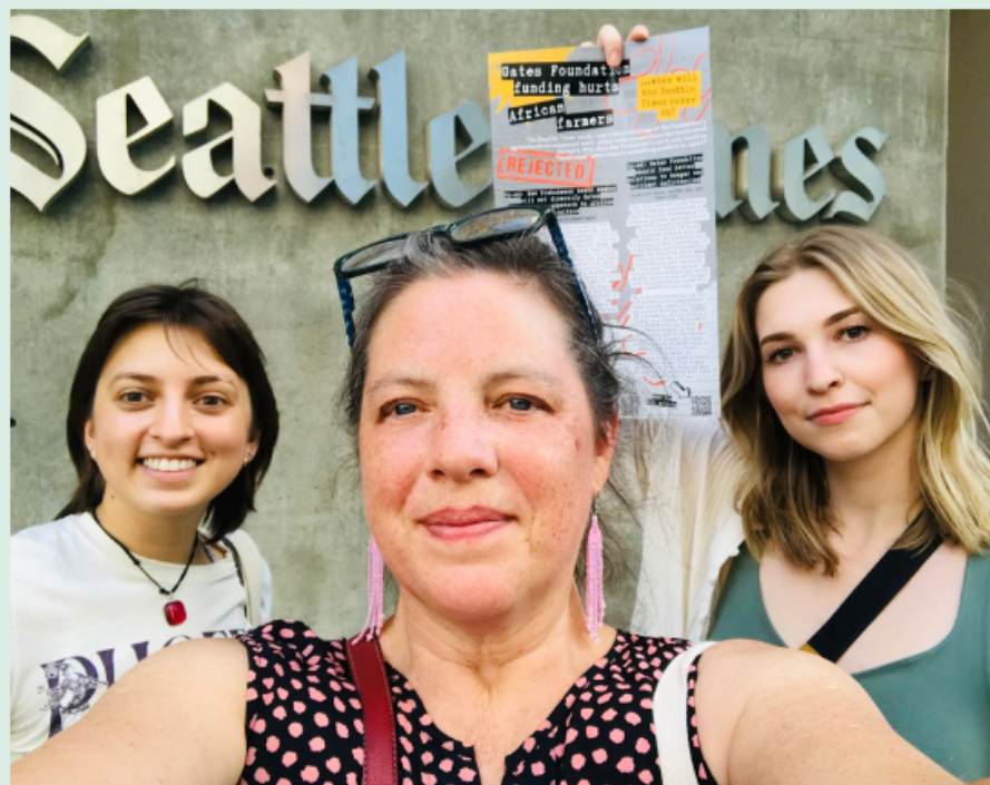
AGRA Watch in action: On left, being interviewed for a French documentary about Gates; on right, calling out the Seattle Times for lack of critical coverage of Gates.