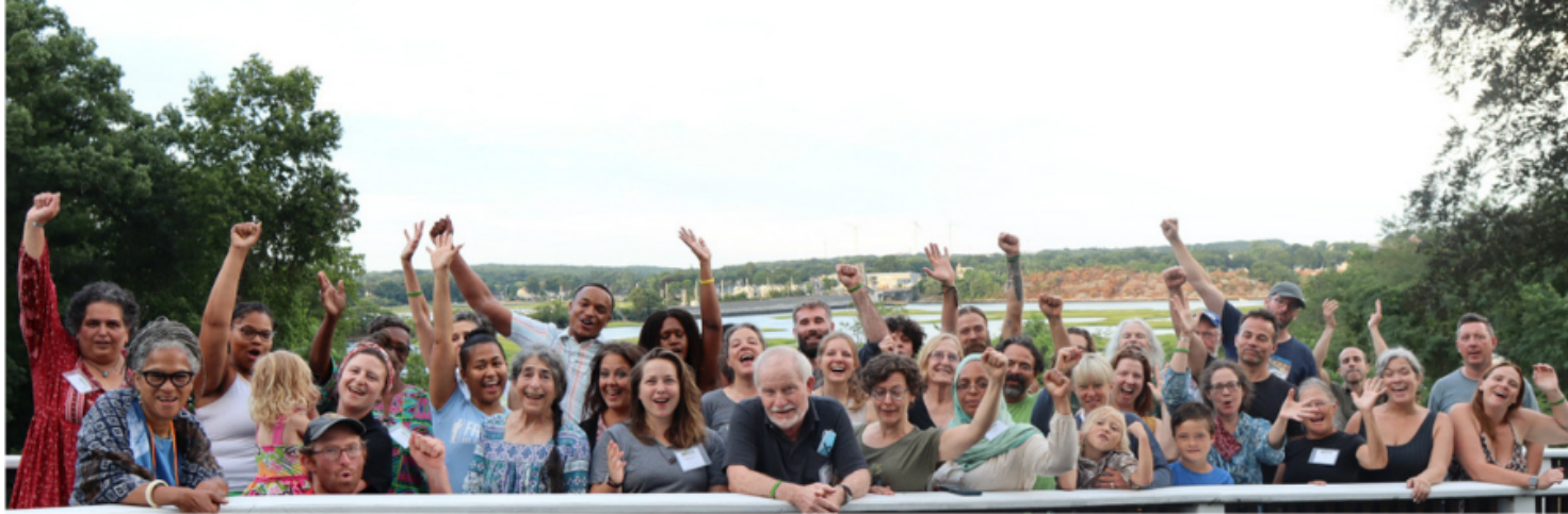
Above: National Family Farm Coalition meeting in Gloucester