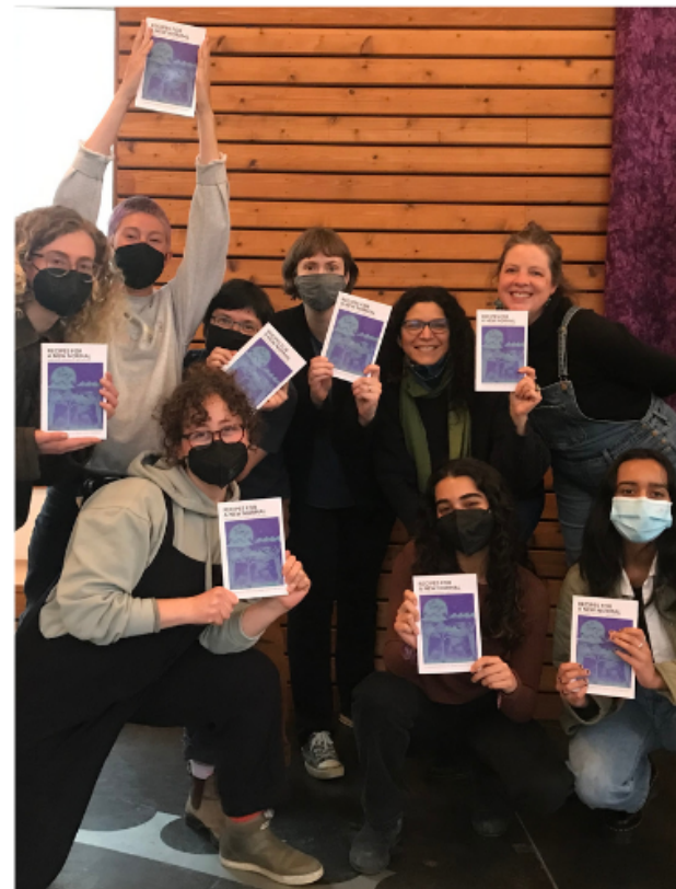
Above: Zine Collective celebrating our print edition!