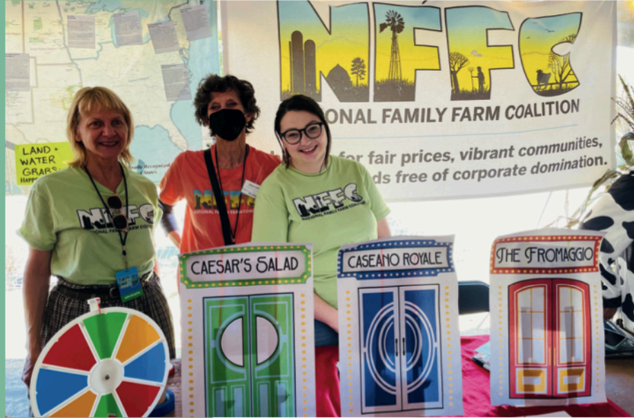
Above: National Family Farm Coalition staff having fun at their Farm Aid booth.

Movement-building is central to CAGJ's strategy, complementing our work to shift narratives. We continued to participate in multiple alliances in 2023, including National Family Farm Coalition, US Food Sovereignty Alliance and Alliance for Food Sovereignty in Africa.