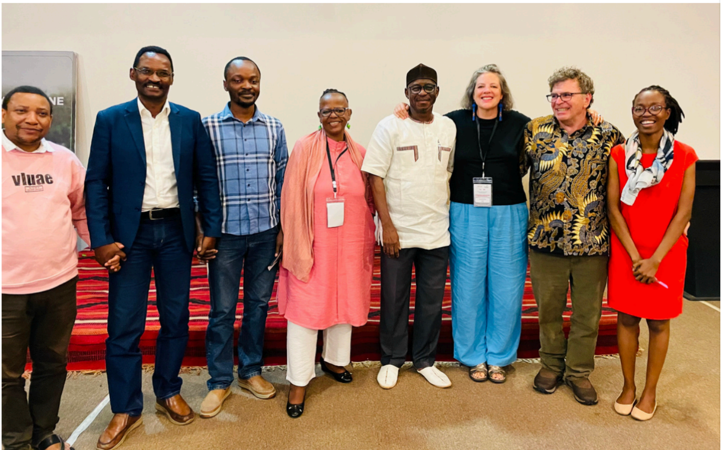
CAGJ members celebrating with panelists after screening of our Rich Appetites films in Dar es Salaam, Tanzania