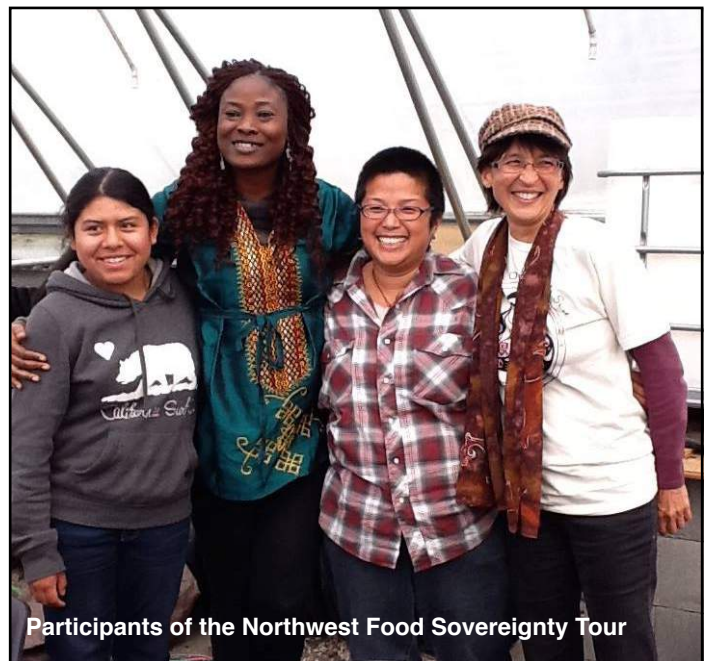
Participants of the Northwest Food Sovereignty Tour

Participants noted that there are already several existing linkages between the US and Africa. For example, the Federation of Southern Cooperatives has projects across Africa through which they have done farmer exchanges, the US Africa Network was recently formed to carry on the long-time work of African solidarity activists and Food First has recently redeveloped Farmer-to-Farmer training with We Are the Solution in Burkina Faso.